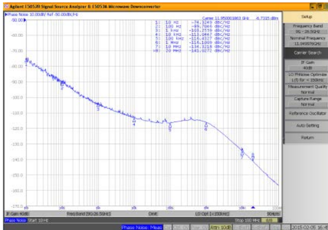
Phase Noise at 12GHz