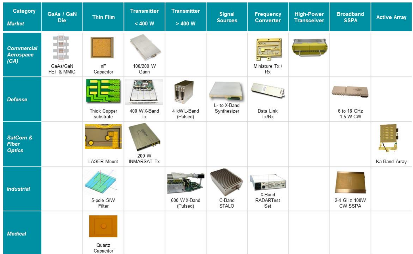
Fig. 1: Overview on NANOWAVE's Product Portfolio and Markets