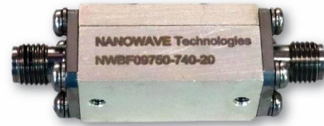
Fig. 1: NWBF09750-740-20

The NWBF09750-740-20 is an X-band Cavity Band-Pass filter module and provides low passband insertion loss, low VSWR and high rejection. The filter provides 740MHz of bandwidth centered at 9.75GHz while achieving a maximum of 0.4dB loss over the bandwidth at a nominal stop-band attenuation of 20dB.